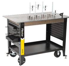
Mobile Welding Table Cart with 42 Piece Fixture & Gridlok Accessory Kit