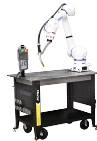
Mobile Welding Table Cart for Cobot Applications